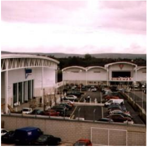
Ashfield Valley in the 1980s and now