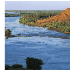
Longest river- River Nile, Africa