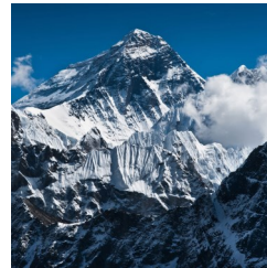
Highest mountain- Mount Everest, Asia